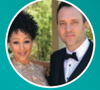
TAMERA MOWRY HOUSLEY & ADAM HOUSLEY