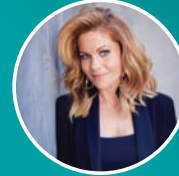
CANDACE CAMERON BURE